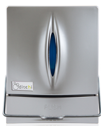
Blue · JPC825GPC