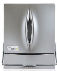
Fumé · JP800GPC